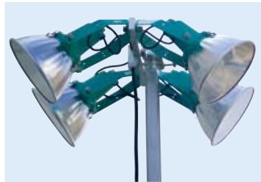
Each lamp can be set to any direction.