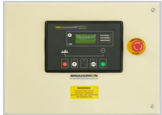
The panel is constructed in 1.5mm steel, powder coated to RAL9001 for a high quality, durable finish.