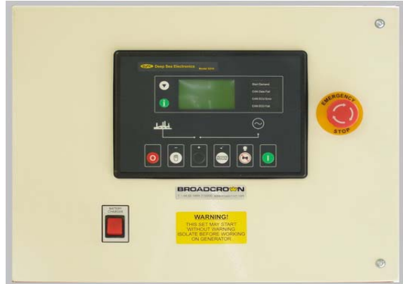
The panel is constructed in 1.5mm steel, powder coated to RAL9001 for a high quality, durable finish.