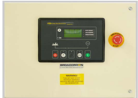
The panel is constructed in 1.5mm steel, powder coated to RAL9001 for a high quality, durable finish.