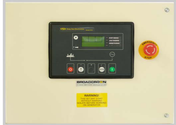
The panel is constructed in 1.5mm steel, powder coated to RAL9001 for a high quality, durable finish.