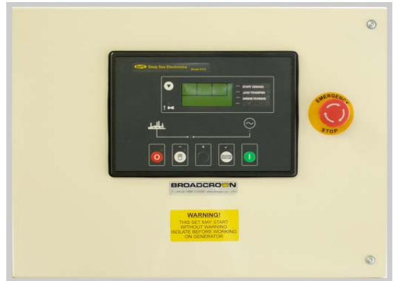
The panel is constructed in 1.5mm steel, powder coated to RAL9001 for a high quality, durable finish.