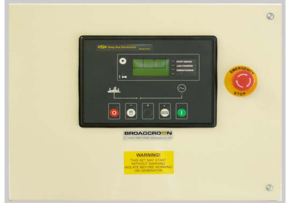
The panel is constructed in 1.5mm steel, powder coated to RAL9001 for a high quality, durable finish.