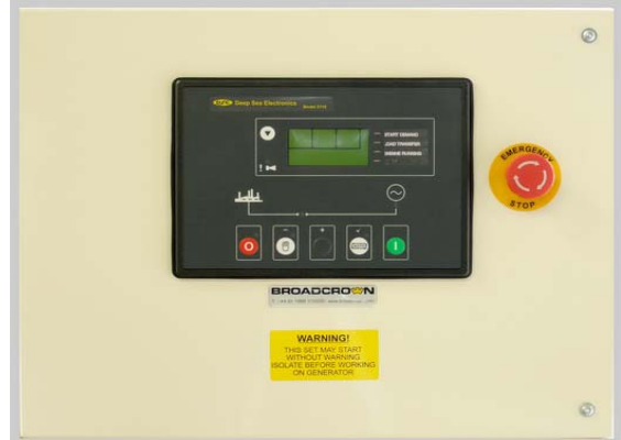
The panel is constructed in 1.5mm steel, powder coated to RAL9001 for a high quality, durable finish.