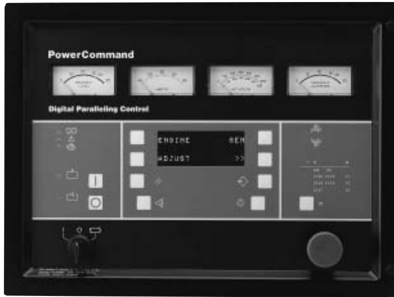
PCS PowerCommand Supervisor standard configuration