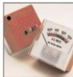
Line Voltage Monitor